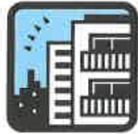
"Easy Living Condo 2"