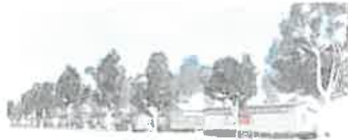
"Blue Haze Mobile Home Park"