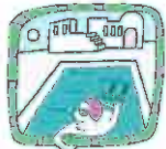
Pool & Clubhouse