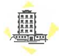
"Easy Living Condo 1"