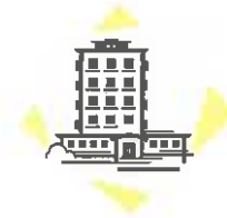
"Easy Living Condo 4"