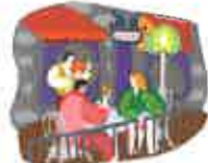
Bella Vida Café