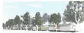
"Blue Haze Mobile Home Park"